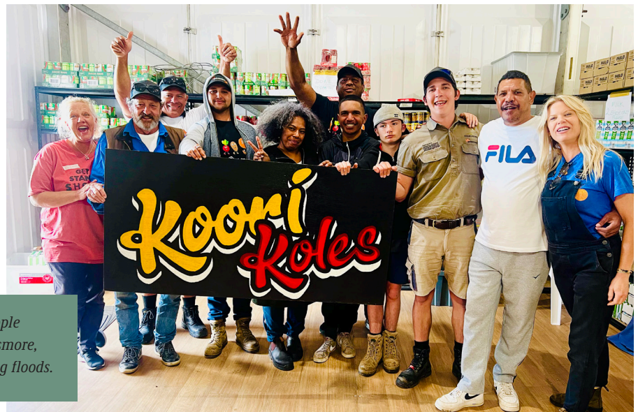
Pathfinders Pumpkin Run team and young people delivering pumpkins to the Koori Kitchen in Lismore, NSW after the 2022 Northern Rivers devastating floods.