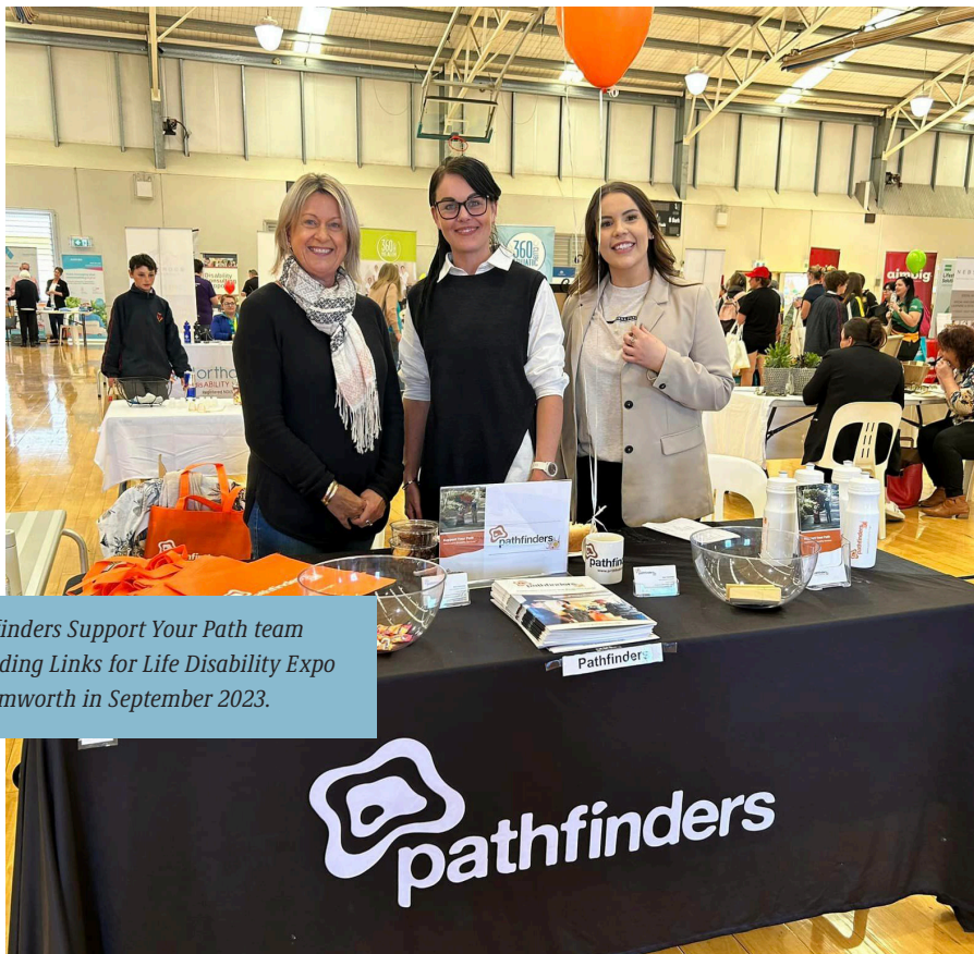
Pathfinders Support Your Path team attending Links for Life Disability Expo in Tamworth in September 2023.